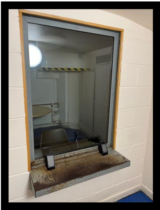
Solicitor meeting room