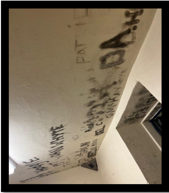
Cell ceiling graffiti damage