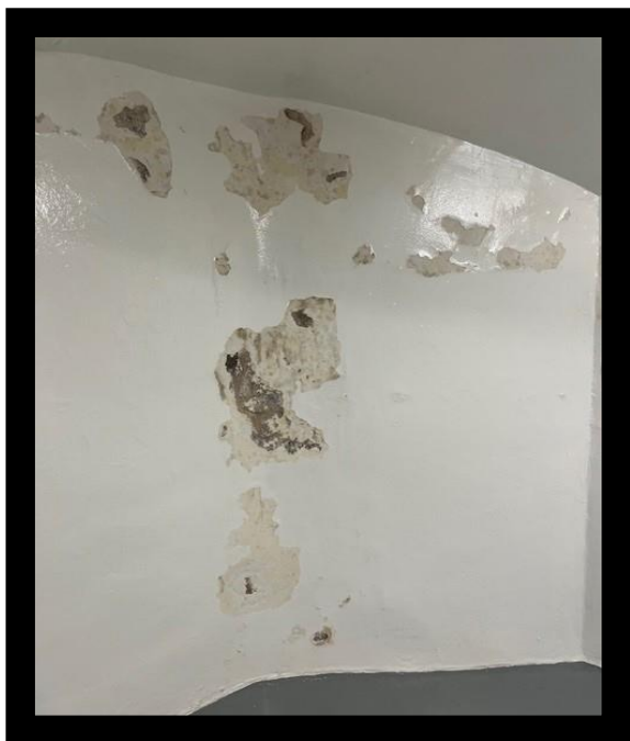
Failing plaster – Cell 1