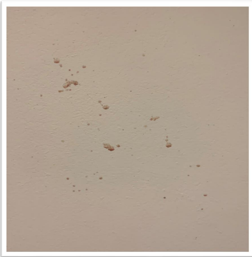
Interview Room 3 – Blood-Stained Mucus