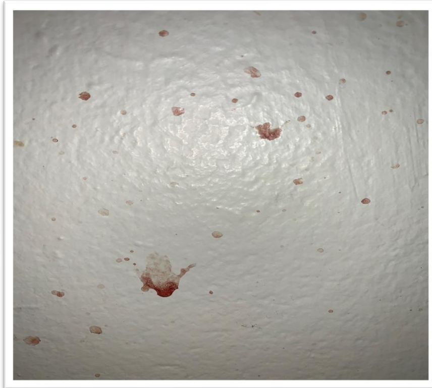
Interview Room 3 – Blood-Stained Mucus