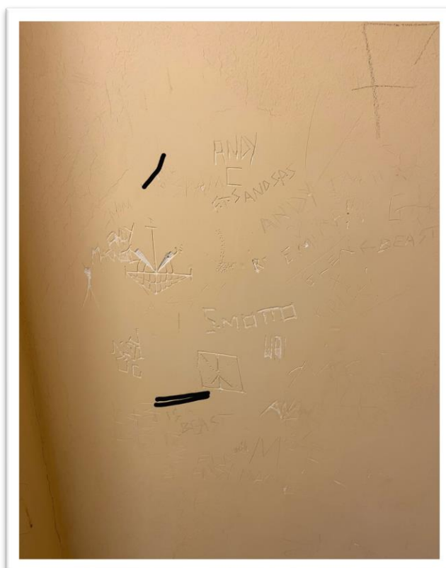
Graffiti on cell wall